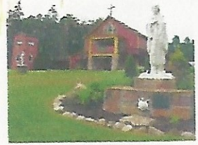
The Kateri Shrine in Fonda, NY