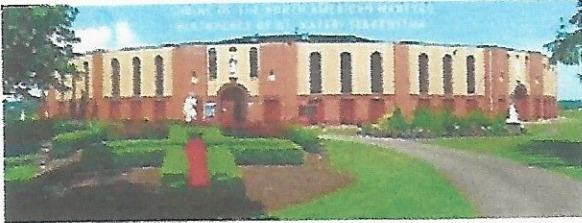
Auriesville - Shrine of the North America Martyrs