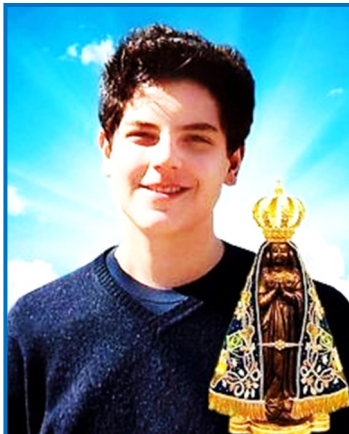
Blessed Carlo Acutis is the creator and designer of the International Exhibition of The Eucharistic Miracles of the World. This amazing exhibit

draws us to a greater understanding and belief in the Real Presence of Jesus Christ in the Eucharist. Sixty poster size panels with written and photographic details of the Miracles will be presented at Holy Cross Church, 4112 E. Genesee St., Dewitt through October 16: M-F 9AM-3PM and W 6-8PM; Sat. 8:15-6PM; Sun. 7AM-7PM. This display of Vatican approved Eucharistic Miracles can be viewed in the Church and Chapel. See www.holycrossdewitt.org/emotw for more information.