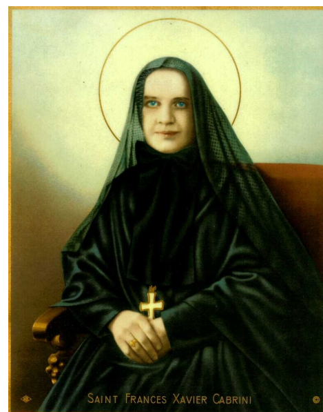
SAINT FRANCES XAVIER CABRINI

In November 1880, she and six other women who had taken religious vows with her founded the Missionary Sisters of the Sacred Heart of Jesus . She founded 67 institutions: in New York; Chicago