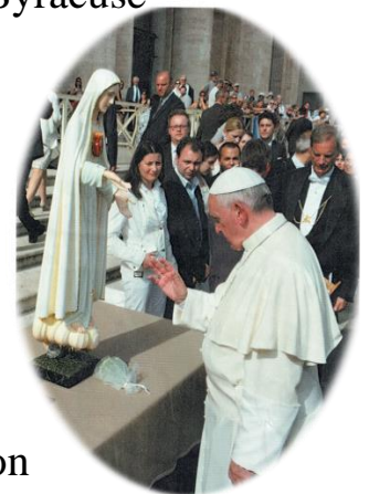
Pope Francis blessing the Pilgrim Statue of the Immaculate Heart of Our Lady of Fatima October 23, 2013.

Details can be found on the reverse side. This flier and individual parish fliers can be found at www.cnymariancenter.com . Please share this coming event with family and friends.