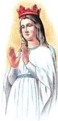
Our Lady of Knock Ireland

For our friends receiving our newsletter via mail or email, we suggest a $20.00 donation for yearly subscriptions. For our friends who do not receive our newsletter, we would ask that you send a donation as your heart dictates. Our heartfelt thanks go to all of you as we keep you in our prayers.